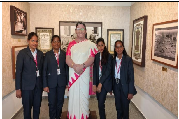
Presidential Portrait Gallery: Observed portraits of Presidents of India, along with significant artifacts from their tenures